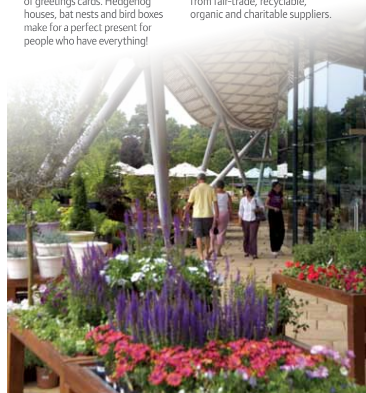
The Golden Jubilee Garden in June