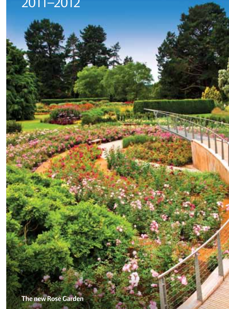
The new Rose Garden